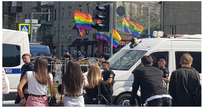
Pride march in Kharkiv on 12 August 2021

Policing of peaceful LGBTI assemblies in Ukraine significantly improved. In particular, LGBTI equality marches in Kyiv, Kharkiv, Odesa and Kryvyi Rih were successfully secured by law enforcement agencies. In response to the posting of leaflets in Odesa featuring photos of members of the LGBTI community and pride march organizers with the inscription "know your enemy", national police initiated a criminal investigation under Article 161 (incitement to hatred or violation of equality of persons on the ground of bias) of the Criminal Code.