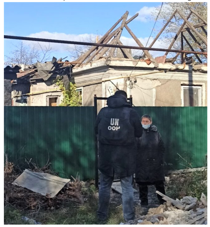
A human rights officer visiting the site of shelling which occurred on 21 October 2021, and spoke with the grandmother of a wounded girl

Mines and explosive remnants of war killed one man and injured two men and one boy in territory controlled by self-proclaimed 'republics', and injured one man in the Government-controlled part of Donetsk region. In addition, one man was killed in a road incident with a member of the military, and one woman was injured by small arms fire in an escalation of force incident, both in the Government-controlled part of Donetsk region.